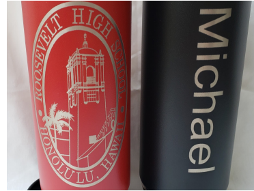
with logo with writing

Order up to 5 water bottles on one order form. Please choose one option for each section.